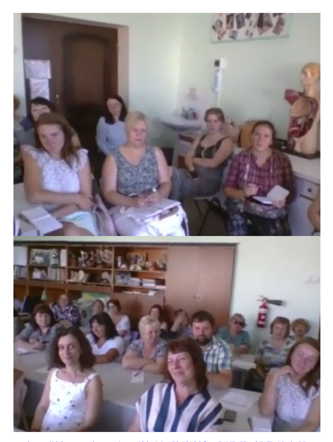
https://drive.google.com/open?id=1GAJ2Ci132f vaPOFvHpuhIsTe13 in55